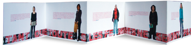
View of the spread « leporello » book (length 1,30 m)

(readingpageonpage). The testimonies of the activists are retranscribed next to their portrait. There is one portrait by page.