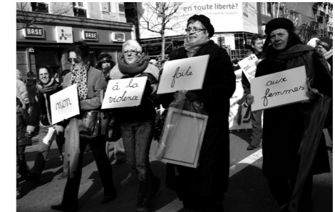
Demonstration of World Marche of Women in Brussels