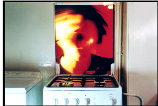
série Les lieux de l'hystérie, 2007-2008