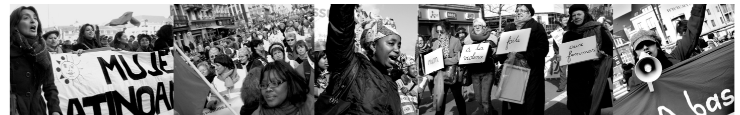
The World March of Women, Bruxelles

The exhibition can be organized from February, 2011.