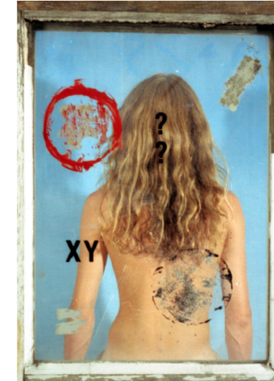
© Claire Malen, YX, questions de genre , 2004