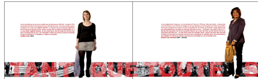
View of the model of the spread book in double page

The dimension of the book is of 16X26 cm closed and 16X130 cm unfolded. It consists of 40 pages on paper 320 g. The book is presented at the same time as the exhibition.